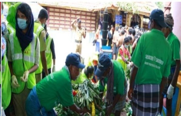
Class on 23-12-2018