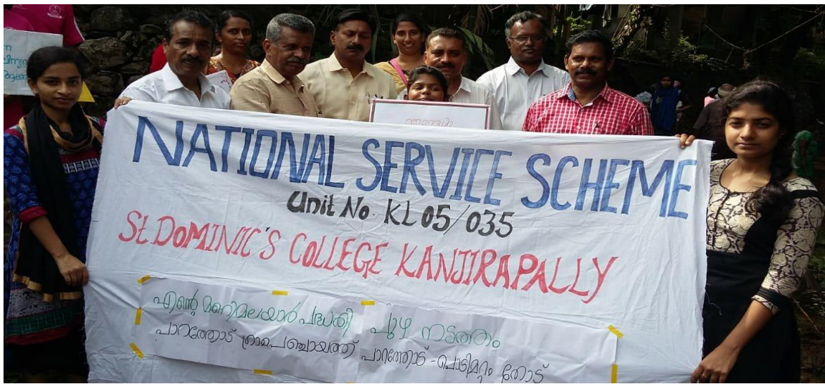
Cleaning of Chittar River 24-12-2018